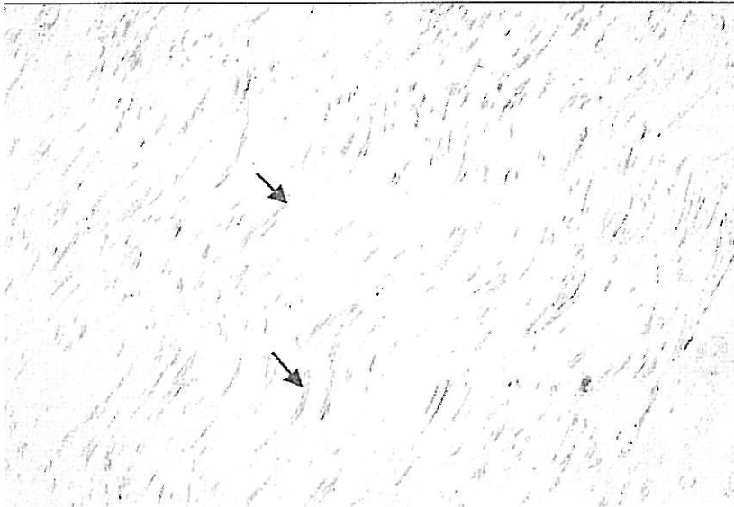
Fig. 1: Typical immunohistochemical section from human lumbar fascia. Arrows indicate examples of stress fiber bundles containing \alpha -smooth muscle actin (a differential marker for myofibroblasts), which are stained in dark red. Length of image 225 \mu m.