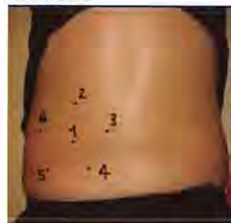
Figure 1 TPD assessment grid on the subject's back, a plastic caliper was used to test the TPD threshold in the different areas.

The movement impairment evaluation was based on Sahrman examination. The sample was divided into two groups (experimental and control group) by randomization: 40 patients were submitted to the sensory discrimination training, while 37 patients took part in the control group. The treatment group underwent 3 session per week lasting 6 weeks (grand total of 18 sessions). All the enrolled subjects were evaluated at baseline (t0), at 6 weeks (t1) and after another 6 weeks follow up (t2).