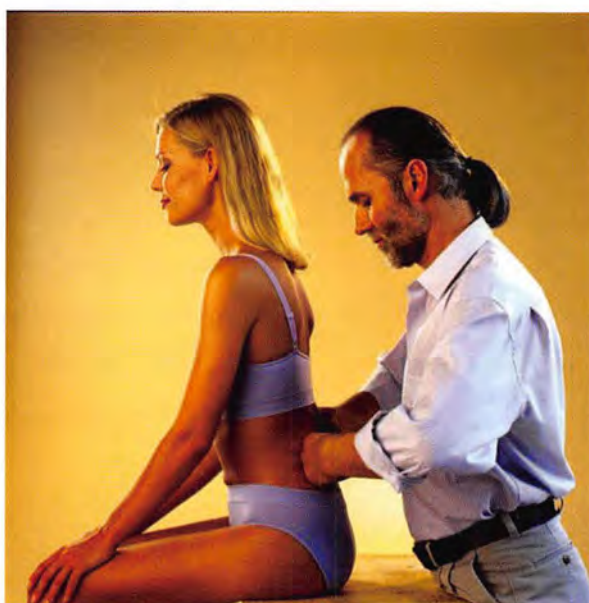
Fig. 2: In the Roling method of Structural Integration the lumbar fasciae are treated with slow but strong manual pressure and shear application (up to 100N per hand) with the aim of increasing proprioceptive refinement and loosening fascial adhesions in this area. During the maneuver demonstrated here the patient is instructed to perform a smooth lumbar flexion in slow motion while gently breathing into the hands of the practitioner at her back. The practitioner tries to hold the tissues medial (preventing them to slide laterally apart) and also moves them slowly in a caudal direction during the client's forward bending motion.