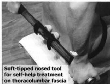
Soft-tipped nosed tool for self-help treatment on thoracolumbar fascia